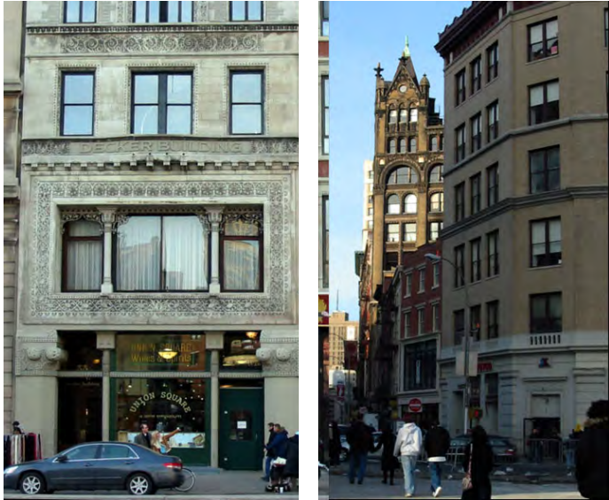
The second (left) and third (right) Factories on Union Square

Four of Warhol's studios were known as "The Factory."